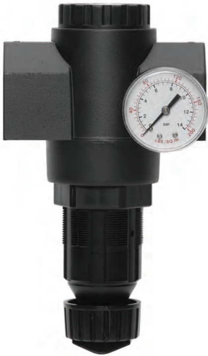
Model Shown: R180-10G