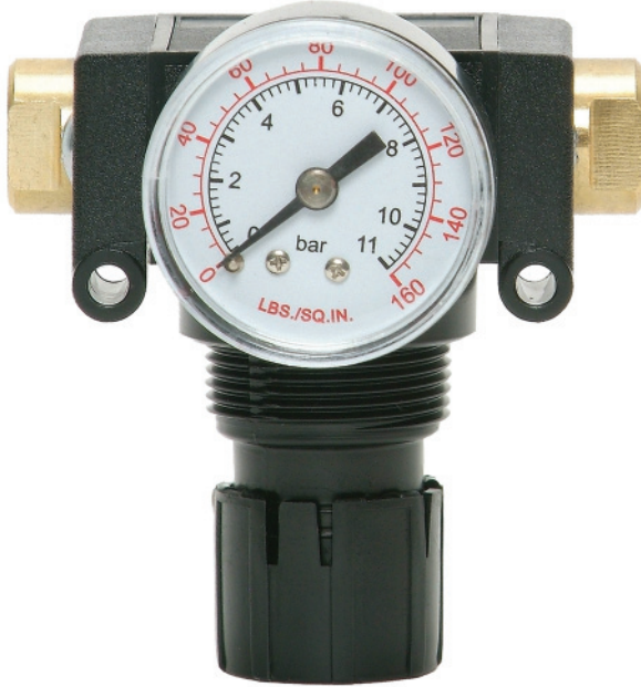
Model Shown: R10M-2G