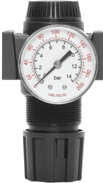
Model Shown: R60-4G